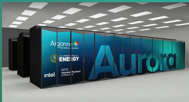
The ALCF's Intel-HPE exascale system is scheduled to arrive in 2022.

The ALCF and the Exascale Computing Project (ECP) are offering several training opportunities, including workshops, webinars, and hackathons, to help researchers prepare for Aurora and other DOE exascale systems. Stay tuned to the ALCF and ECP websites for upcoming opportunities.