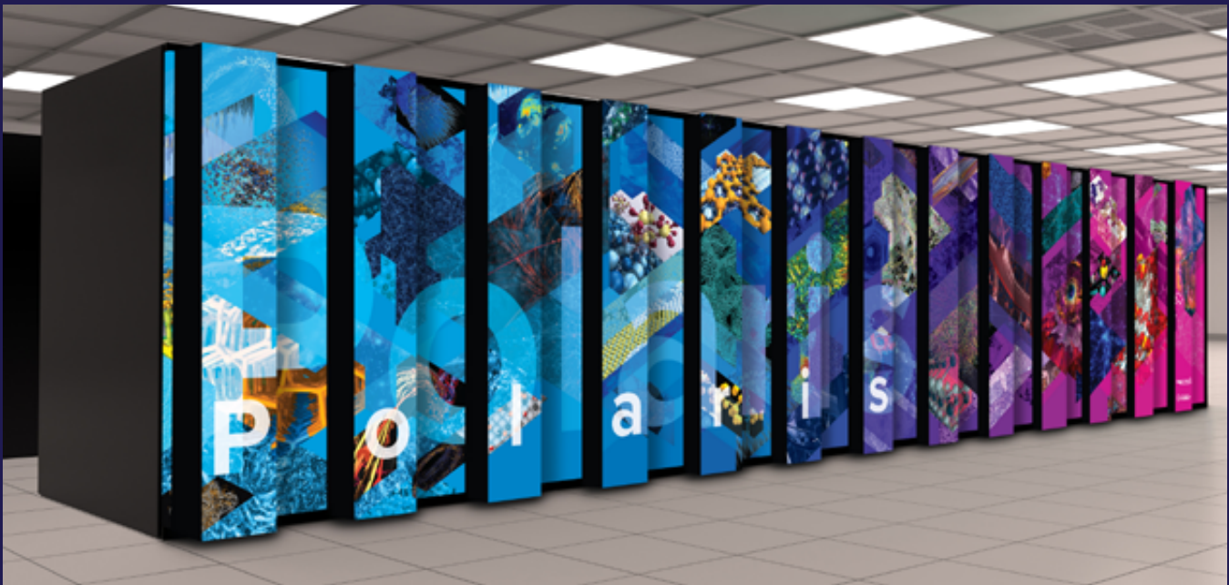
Polaris, a hybrid CPU-GPU system built by HPE, will help ready scientists for the arrival of the lab's Aurora exascale supercomputer.

Argonne National Laboratory's new supercomputing resource will accelerate efforts to prepare applications and workloads for Aurora.